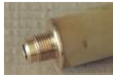
SAE45° Flared Fitting or JIC37° Flared Fitting