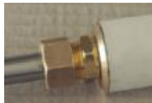
Compression Fitting (Metric)